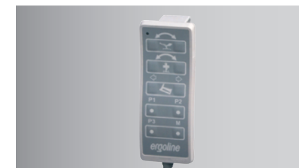
Memory control unit (motor control)