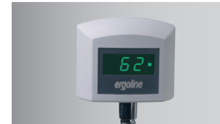
Patient display showing speed