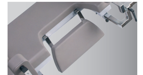
Padded drop section for ultrasound examinations