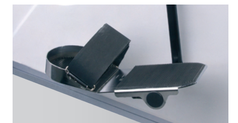
Pedal shoes with Velcro ties