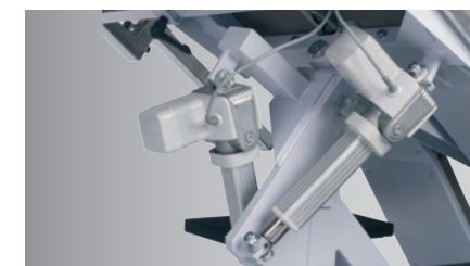
Motor adjustment for "incline" and "tilt"