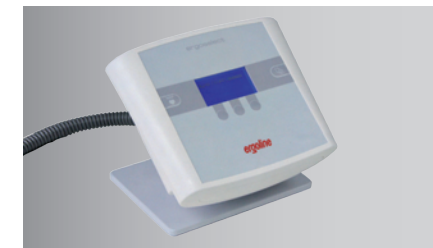
Detachable control unit